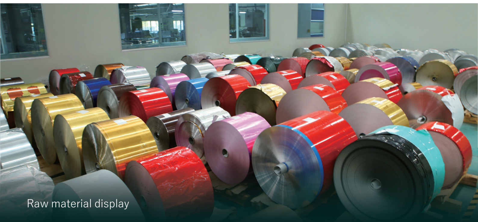
Raw material display